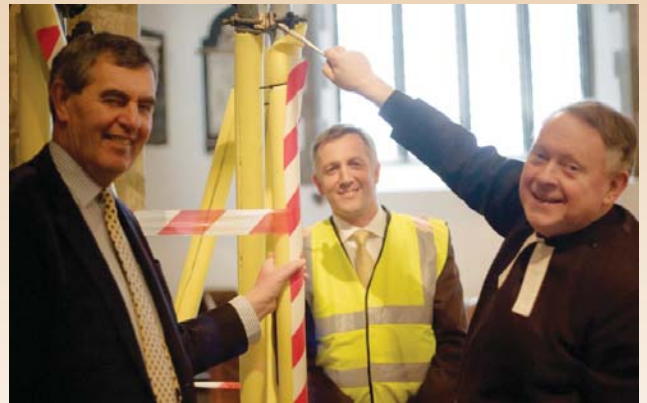
The Dean tightens the last bolt in the scaffolding ready for work to begin on the Cathedral roof. While work is progressing, mid-week morning Services will be held in Chapter House (previously called Cathedral Hall), mid-week evening and Sunday Services will be held in the cathedral itself.