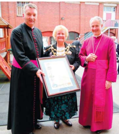
At the reception in St Woolos School, the Mayor of Newport presented the Dean with a framed copy of the Newport City Charter.

A cathedral is primarily a place of teaching. It is where the bishop has his cathedra, his chair, and from which, in former times, he would sit and teach. A cathedral is a place where the preaching and teaching should be biblical, inspirational and challenging. The gospel reading challenges us, “Why do you call me Lord, Lord, and never do what I tell you?” Yes, there should be no distinction between what we believe and how we behave – word and action should be in perfect harmony.