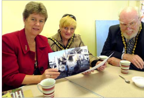
Coffee Morning at St Brides Major attended by Jane Hutt AM and the Mayor of the Vale of Glamorgan

Parishioners across Wales responded generously to the Archbishop of Wales' urgent appeal for money to restock the Shija'ia Family Health Centre, following its destruction in January 2009. Most of the money was raised through coffee mornings held on the first weekend in May 2009. A young Muslim group in Newport raised £1000 through a bazaar, and a band playing Jewish klezmer music collected donations in Llanidloes.